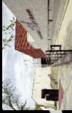
South Dakota Art Museum