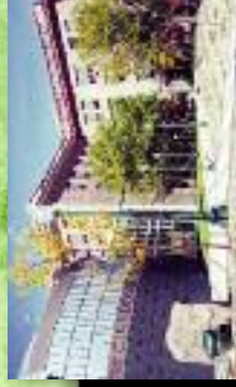
Washington Pavilion of Arts and Science