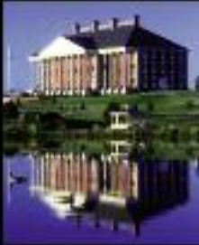
HORSE BARN ARTS CENTER • REDLIN ART CENTER