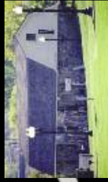
Horse Barn Arts Center