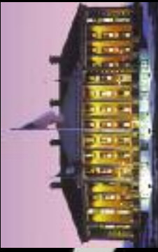
Redlin Art Center