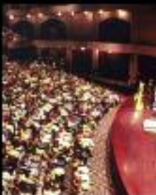
THE OUTDOOR CAMPUS • WASHINGTON PAVILION