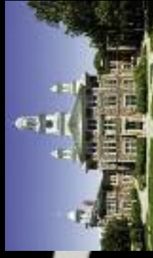
Oscar Howe Art Gallery