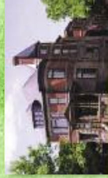
Siouxland Heritage Museums