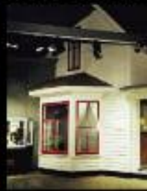
SIouxLAND HERITAGE • S.D. AG HERITAGE MUSEUM