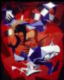
S.D. ART MUSEUM • SWC • OSCAR HOWE ART GALLERY