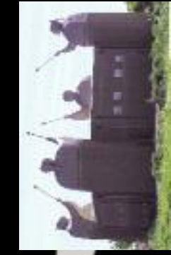
Sisseton Wahpeton College