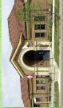
S.D. State Agricultural Heritage Museum