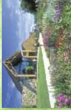
The Outdoor Campus